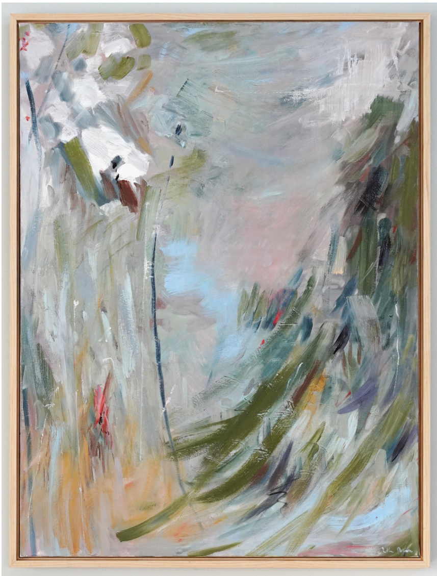
Painting IN THE QUIET OF MORNING Oil on Canvas Custom Frame Alabama Pine 38x50" (Framed) $2,400