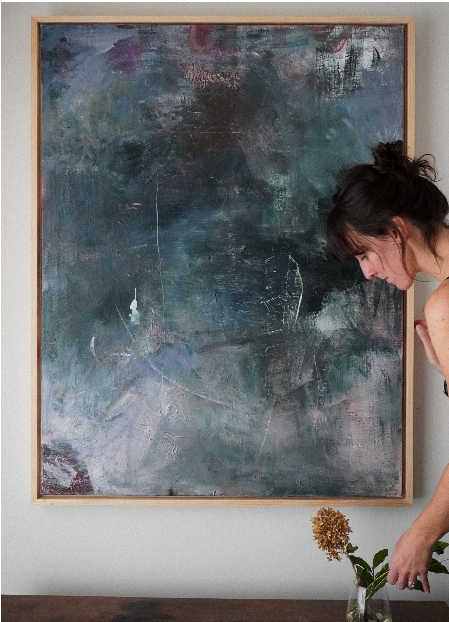
Painting FROM BENEATH THE SURFACE Oil and Wax on Canvas Custom Frame Alabama Pine 38x50" (Framed) $2,400